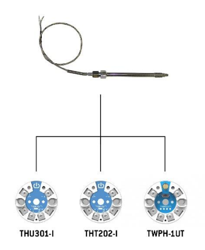
Figure 2 - Tekon Electronics inhead transmitters with thermocouple connection

in wired and wireless segments in order to leave their application open to different environments. The output signal of head transmitters is characterized by its mA format, in a range of 4 to 20, via Modbus RTU communication protocols for wired models, and via Tinymesh™ protocol for wireless models.